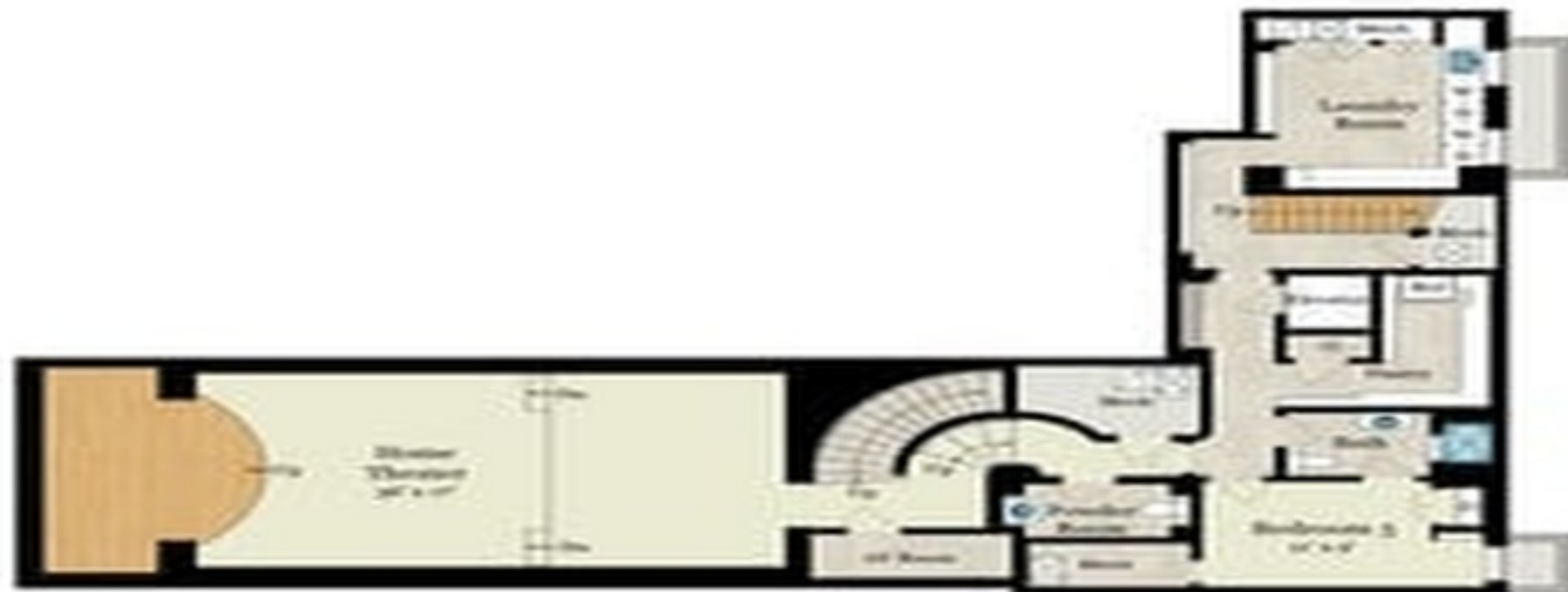
MAIN RESIDENCE LOWER LEVEL 1,016 SQ. FT.