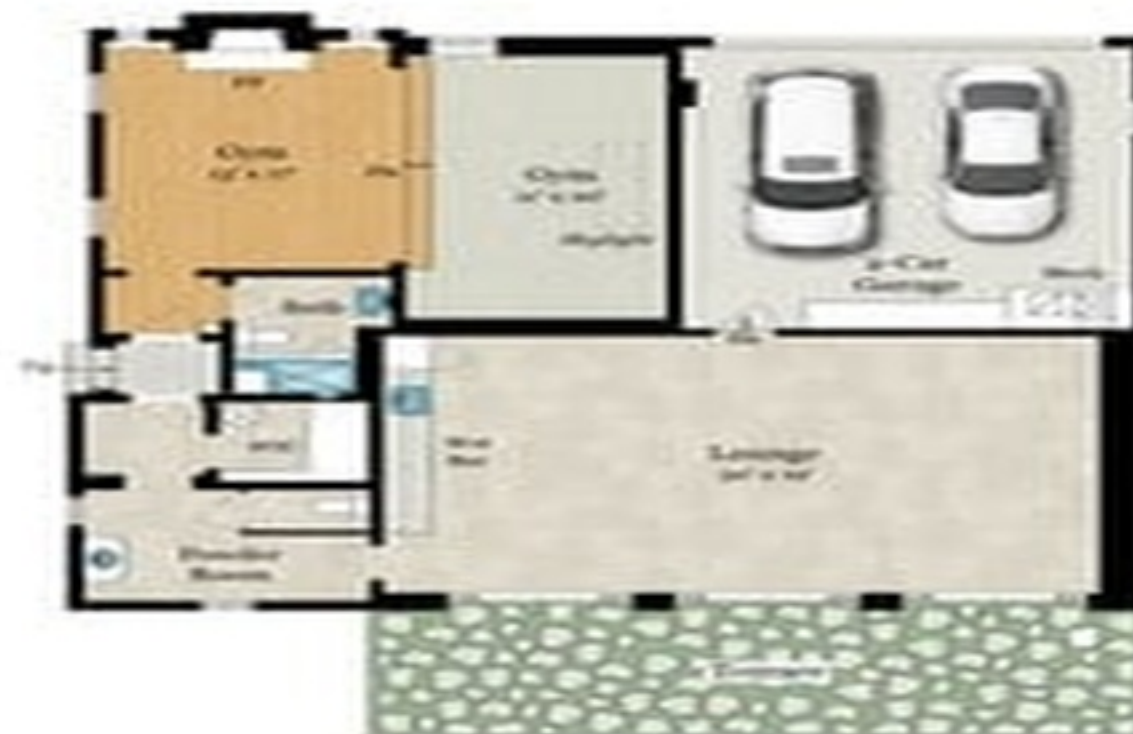
GUEST HOUSE 1,440 SQ. FT.